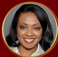
Rep. Dotie Joseph