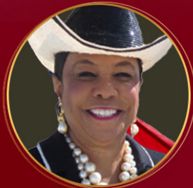
Honorable Frederica Wilson