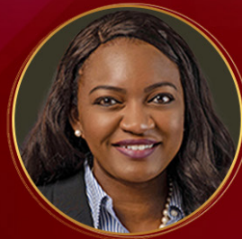
Honorable Fentrice Driskell