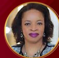
Tanya Clay House