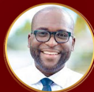
Senator Shevrin Jones