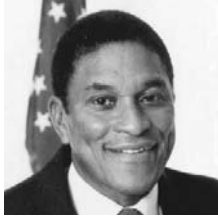
HON. JOHNNY FORD Mayor Tuskegee, AL