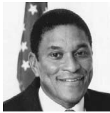
Hon. Johnny Ford Mayor Tuskegee, Alabama