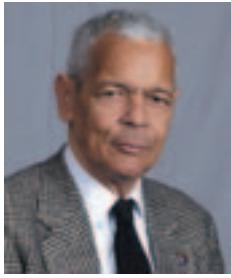
Julian Bond, Chairman Board of Directors