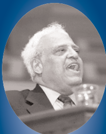
Honorable Benjamin L. Hooks